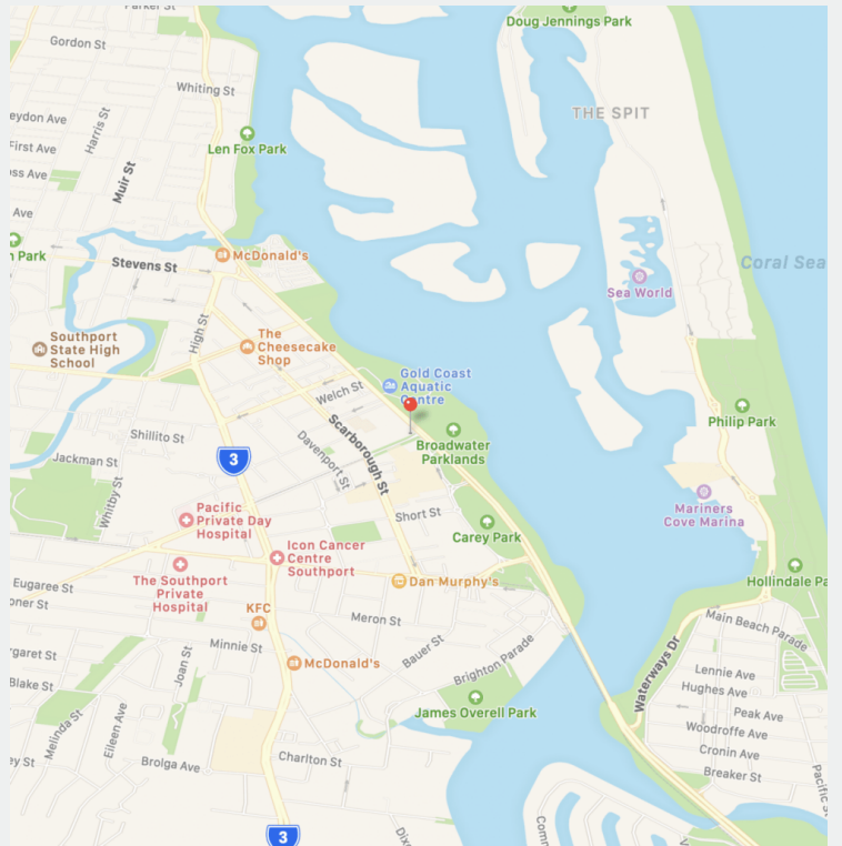
1 Nerang Street, Southport