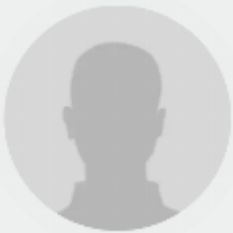
Jocelyn SHAO TBA

Students who are unable to meet the academic or English language criteria may in some cases be eligible to undertake our Language, Literacy & Numeracy (LLN) test. Criteria may change at any time without notice. Additional English language requirements may apply to international applicants from non-English speaking backgrounds wishing to articulate on a visa package into a university programme. Students must be able to (and are required to) enrol, participate, demonstrate progression-of, and complete this course.